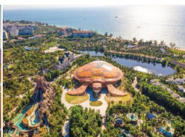
VINWONDERS PHU QUOC 珍珠乐园 Vinwonders Amusement Park: 12 km away from Wyndham Grand Phu Quoc.