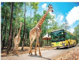
VINPEARL SAFARI 野生动物园 Vinpearl Safari Phu Quoc - Vietnam's largest semi-wildlife park, within 3.0 km from Wyndham Grand Phu Quoc.