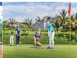
VINPEARL GOLF 高尔夫 A unique Golf course amidst the primeval forest with stunning views within 1.8 km from Wyndham Grand Phu Quoc.