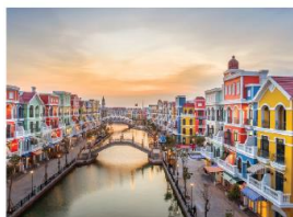
GRAND WORLD 大世界 The Nightless City of Festival: 300m away from Wyndham Grand Phu Quoc.